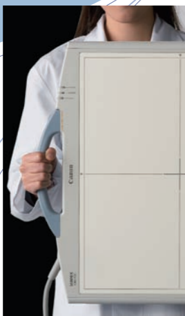
Easy-carry ergonomic design, weighs just 4.8 kg (10.6 lb.)

Less than an inch thick (23 mm) and weighing only 4.8 kg (10.6 lb.), the compact CXDI-50C can be flexibly used in diverse applications, including trauma, ICU, and bedside exams. It's portable, lightweight, and easy to position—even the patient can comfortably hold the unit in place during image capture, if necessary.