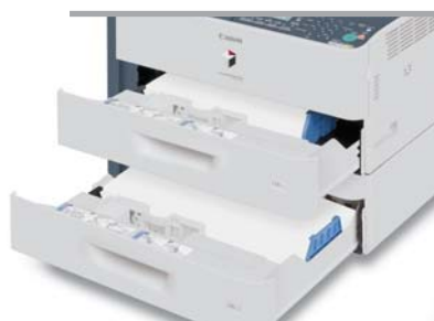
Expandable Paper Supply