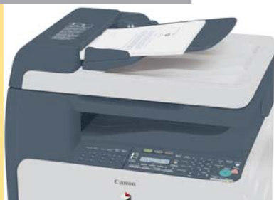
Duplexing Automatic Document Feeder