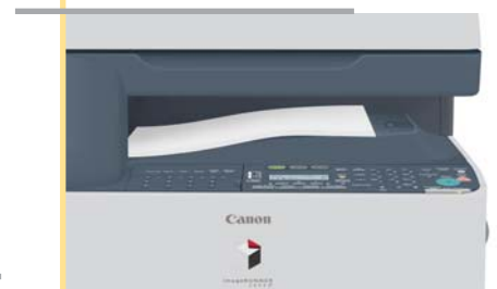
Integrated Output Tray

Plug-and-play connectivity is provided via a standard USB 2.0 Hi-Speed interface for optimal performance. Best of all, each model can be fully networked so you can extend system capabilities to multiple users (optional for the Canon imageRUNNER 1025 model).