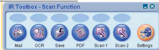
iR Toolbox Menu

The imageRUNNER 1025 Series models are easy to manage and maintain as well. The embedded Department ID Mode tracks and limits system access to those users assigned valid IDs and passwords. In addition, device management utilities, including a browser-based Remote User Interface (UI), provide real-time monitoring and status information, while high-yielding supplies and consumables help keep operating costs to a minimum. Even more, as an ENERGY STAR® qualified system, the imageRUNNER 1025 Series models are designed with the environment in mind.