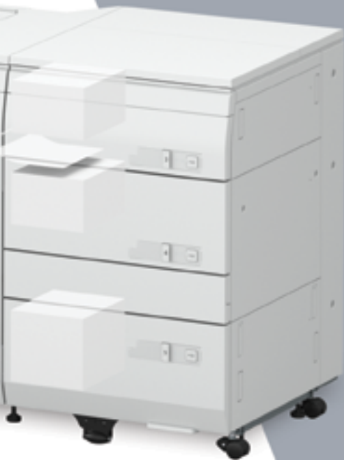
imagePRESS V1000 shown with optional accessories.