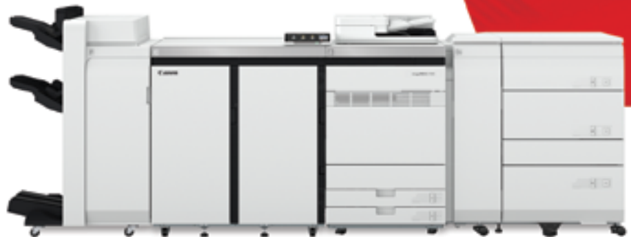
imagePRESS V1000 shown with optional accessories.