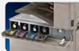
Easy Toner Access