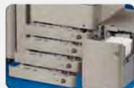
One-button Paper Access